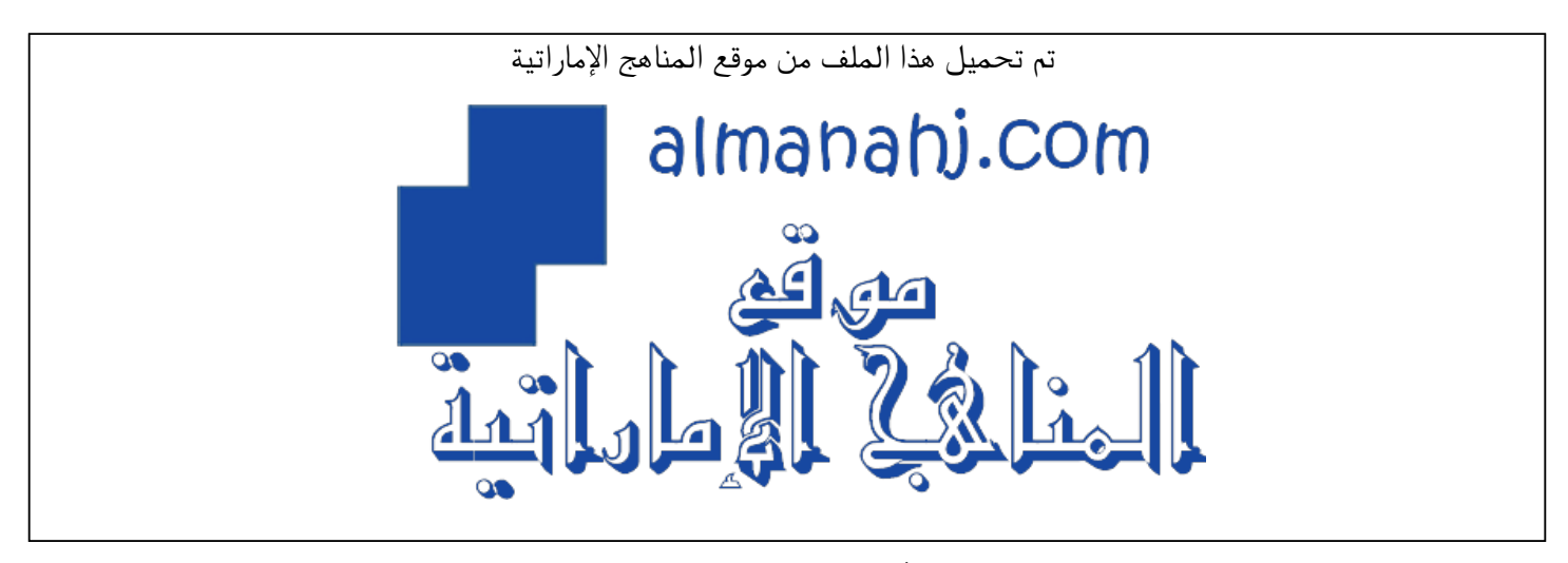
*للحصول على أوراق عمل لجميع الصفوف وجميع المواد اضغط هنا