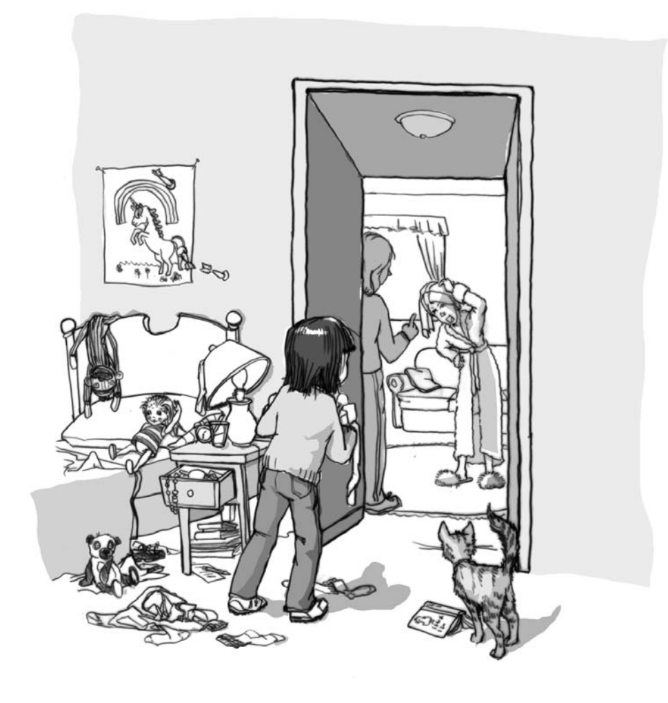
the living room, where Picky-picky, as cross and bored as the rest of the family, was once again meowing at the front door. "Where can't Beezus go?" she asked.