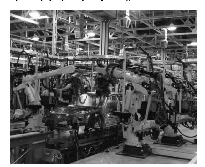
10.4.1. General philosophy – principles of management

The methods involved are numerous; it is not easy to find one's way around! We will try to highlight the salient features of the system.