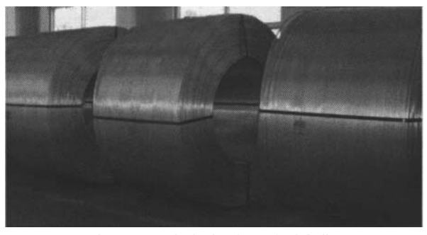
Figure 1. Typical Aluminum Rod Coils

Aluminum rod is produced all over the world and is considered a commodity having a consistent price and standardized characteristics throughout the global market place. The most common aluminum wire rod diameter is 9.53 \text{ mm} (3/8^{\circ}) . Wire rod is usually shipped in coil form. See Figure 1 for an example of typical aluminum wire rod coils and see Table I for the dimensions of typical aluminum wire rod coils.