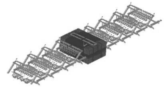
Figure1. Model of magnetic field

Where: D,electric flux density vector. p,electric charge density. B,magnetic flux density vector. E,electric field intensity vector. t,time. H,magnetic field intensity vector. J,total current density vector. D,electric flux density vector.