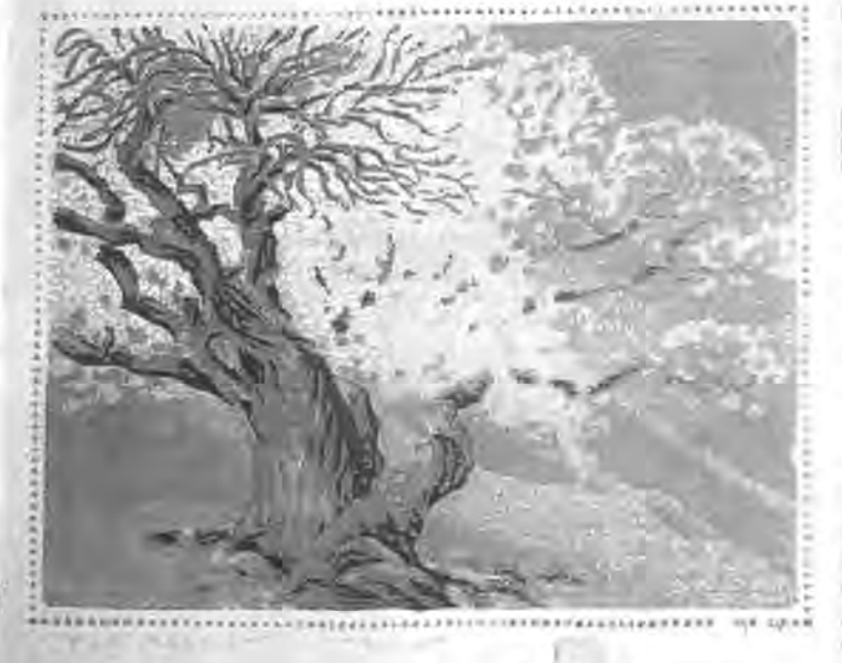
"The Bishop's Apricot." Woodblock print by Gustave Baumann, 1920. (Completed seven years before the publication of Death Comes for the Archbishop.)

The third and final mobile section added to the text of Death Comes for the Archbishop is "Cathedral,"