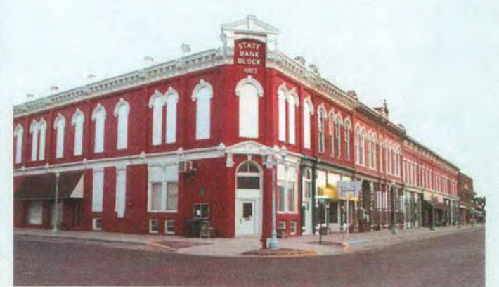
The Moon Block, next to the 1885 Opera House, trails off into the distance.

Change. It seldom comes easily. In My Ántonia , Cather provides a confusing picture of her own feelings toward the inevitability of change. On the one hand, she presents Virgil's view that "in the lives of mortals, the best days are the first to flee"; on the other, she portrays the changes in the land